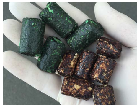
Baits covered in deer repellent. The non-toxic pre-feed pellets are brownish-tan while the toxic baits are green.

The operation will have additional conservation benefits for native birds and bush. Possums eat the forest canopy and prey on native birdlife, including eggs and chicks. Biodegradable 1080 is also extremely effective at controlling other introduced predators such as ship rats and stoats.